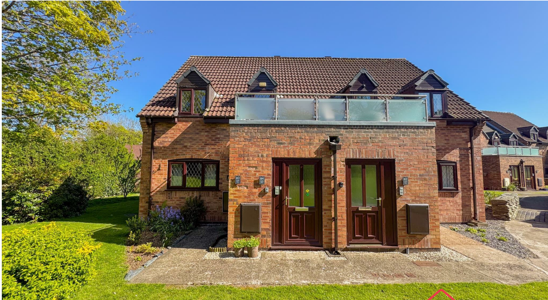
84 Saddle Mews, Douglas, Isle of Man, IM2 1HT Asking Price £172,000